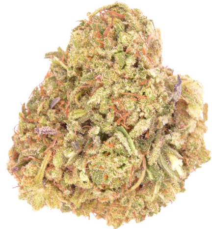
Sample Photo: Relax Private Reserve Line

Results valid for sample tested and metrologically traceable to an SI unit. LOD = 0.0433 ug/mL, LOQ = 0.2164 ug/mL or better. Values are presented by weight per cent within an error of 4.5% of the reported value with 95% confidence. Sampling per 16 CCR 42 Article 3, if required. Report shall not be reproduced except in full, without written approval from Coastal Analytical.