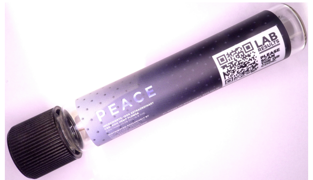
Sample Photo: Peace

Results valid for sample tested and metrologically traceable to an SI unit. LOD = 0.0433 ug/mL, LOQ = 0.2164 ug/mL or better. Values are presented by weight per cent within an error of 4.5% of the reported value with 95% confidence. Sampling per 16 CCR 42 Article 3, if required. Report shall not be reproduced except in full, without written approval from Coastal Analytical.