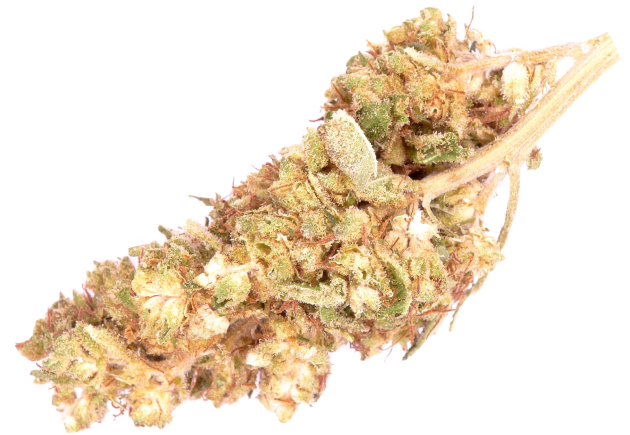
Sample Photo: Peace Private Reserve Line

Results valid for sample tested and metrologically traceable to an SI unit. LOD = 0.0433 ug/mL, LOQ = 0.2164 ug/mL or better. Values are presented by weight per cent within an error of 4.5% of the reported value with 95% confidence. Sampling per 16 CCR 42 Article 3, if required. Report shall not be reproduced except in full, without written approval from Coastal Analytical.