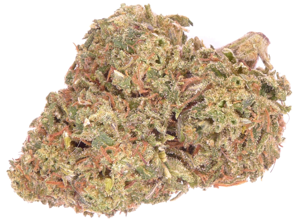
Sample Photo: Hustle Premium Line

Results valid for sample tested and metrologically traceable to an SI unit. LOD = 0.0433 ug/mL, LOQ = 0.2164 ug/mL or better. Values are presented by weight per cent within an error of 4.5% of the reported value with 95% confidence. Sampling per 16 CCR 42 Article 3, if required. Report shall not be reproduced except in full, without written approval from Coastal Analytical.