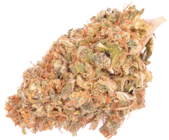
Sample Photo: Energy Ultra Premium Line

Results valid for sample tested and metrologically traceable to an SI unit. LOD = 0.0433 ug/mL, LOQ = 0.2164 ug/mL or better. Values are presented by weight per cent within an error of 4.5% of the reported value with 95% confidence. Sampling per 16 CCR 42 Article 3, if required. Report shall not be reproduced except in full, without written approval from Coastal Analytical.