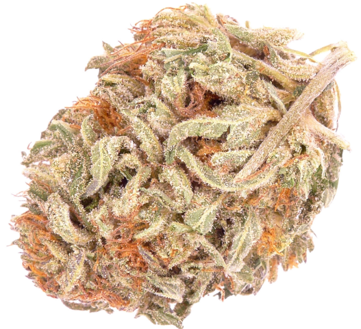
Sample Photo: Dream Private Reserve Line