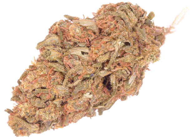
Sample Photo: Dream Premium Line

Results valid for sample tested and metrologically traceable to an SI unit. LOD = 0.0433 ug/mL, LOQ = 0.2164 ug/mL or better. Values are presented by weight per cent within an error of 4.5% of the reported value with 95% confidence. Sampling per 16 CCR 42 Article 3, if required. Report shall not be reproduced except in full, without written approval from Coastal Analytical.