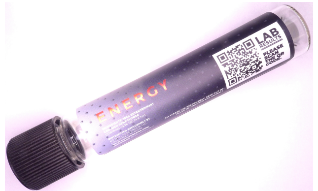
Sample Photo: Energy

Results valid for sample tested and metrologically traceable to an SI unit. LOD = 0.0433 ug/mL, LOQ = 0.2164 ug/mL or better. Values are presented by weight per cent within an error of 4.5% of the reported value with 95% confidence. Sampling per 16 CCR 42 Article 3, if required. Report shall not be reproduced except in full, without written approval from Coastal Analytical.