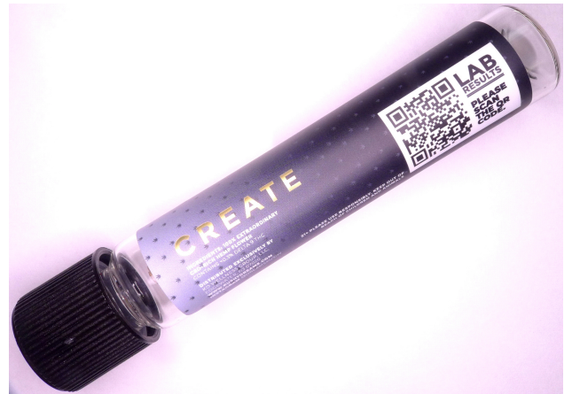
Sample Photo: Create

Results valid for sample tested and metrologically traceable to an SI unit. LOD = 0.0433 ug/mL, LOQ = 0.2164 ug/mL or better. Values are presented by weight per cent within an error of 4.5% of the reported value with 95% confidence. Sampling per 16 CCR 42 Article 3, if required. Report shall not be reproduced except in full, without written approval from Coastal Analytical.