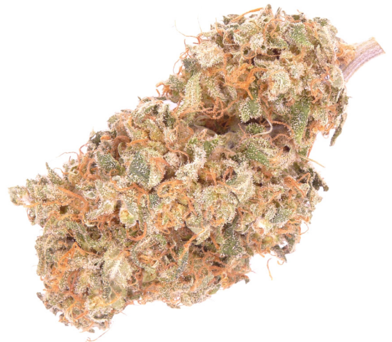
Sample Photo: Hustle Ultra Premium Line

Results valid for sample tested and metrologically traceable to an SI unit. LOD = 0.0433 ug/mL, LOQ = 0.2164 ug/mL or better. Values are presented by weight per cent within an error of 4.5% of the reported value with 95% confidence. Sampling per 16 CCR 42 Article 3, if required. Report shall not be reproduced except in full, without written approval from Coastal Analytical.