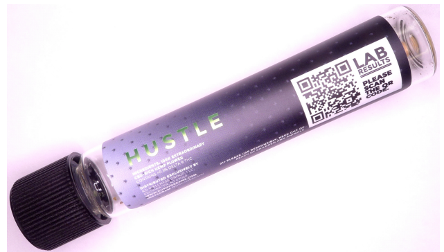
Sample Photo: Hustle

Results valid for sample tested and metrologically traceable to an SI unit. LOD = 0.0433 ug/mL, LOQ = 0.2164 ug/mL or better. Values are presented by weight per cent within an error of 4.5% of the reported value with 95% confidence. Sampling per 16 CCR 42 Article 3, if required. Report shall not be reproduced except in full, without written approval from Coastal Analytical.